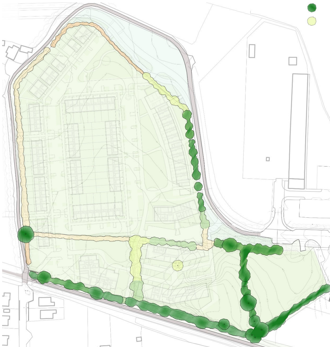
Figure 2 - Proposed layout, highlighting the trees proposed for retention (dark green).

Avenir Homes Ltd. intend to apply for permission for the construction of a mixed-use residential and student accommodation development comprised of 2-3 storey dwelling houses and 4-6 storey apartment blocks. The proposed development provides for outdoor amenity areas, car and bicycle parking, designated pedestrian and bicycle routes, and landscaping with 285 new trees.