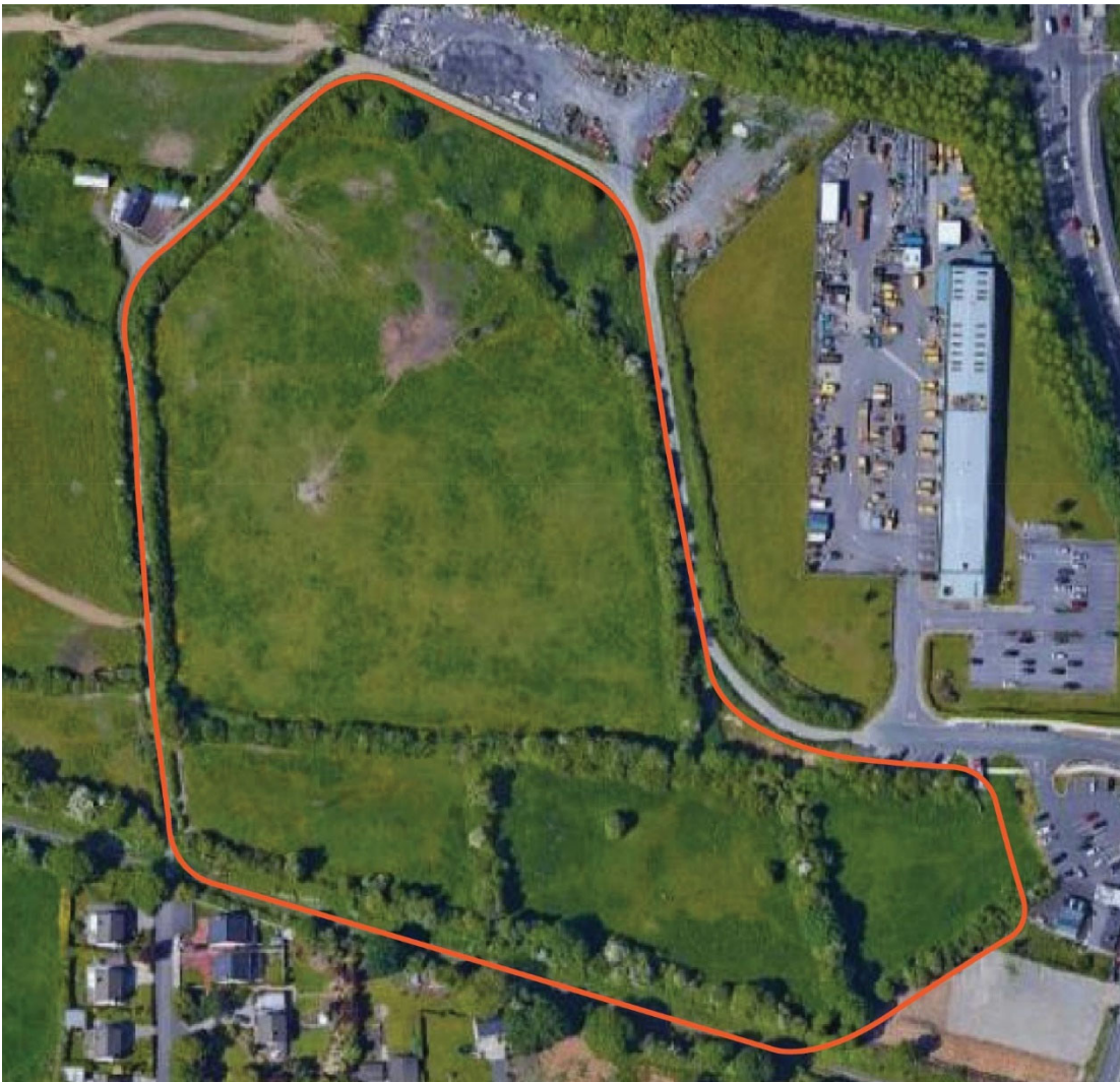
Figure 1 – Extent of Tree Survey highlighted in orange. (Survey extends beyond site boundary for this application).

The proposed site consists of a series of large open fields that are divided by hedgerows. All the principal trees are located within the hedgerows, with a single mature Blackthorn as an isolated mature shrub. There are no A-category trees on the site. All seven of the large trees surveyed are to be retained in the proposed scheme and the proposed planting scheme will enhance and increase the local arboreal stock of the site.